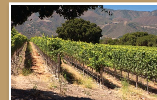
Vigna Monte Nero